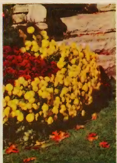
GOLDEN MOUND. 50c each; 3 for $1.25